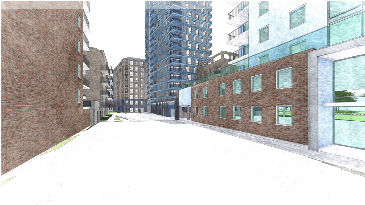
FIGURE 8. PROPOSED SCHEME