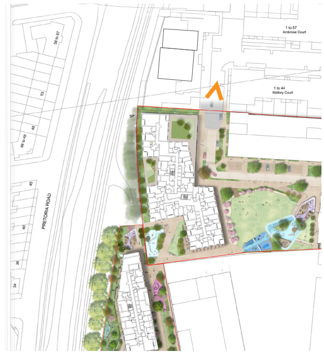
FIGURE 6. KEY PLAN