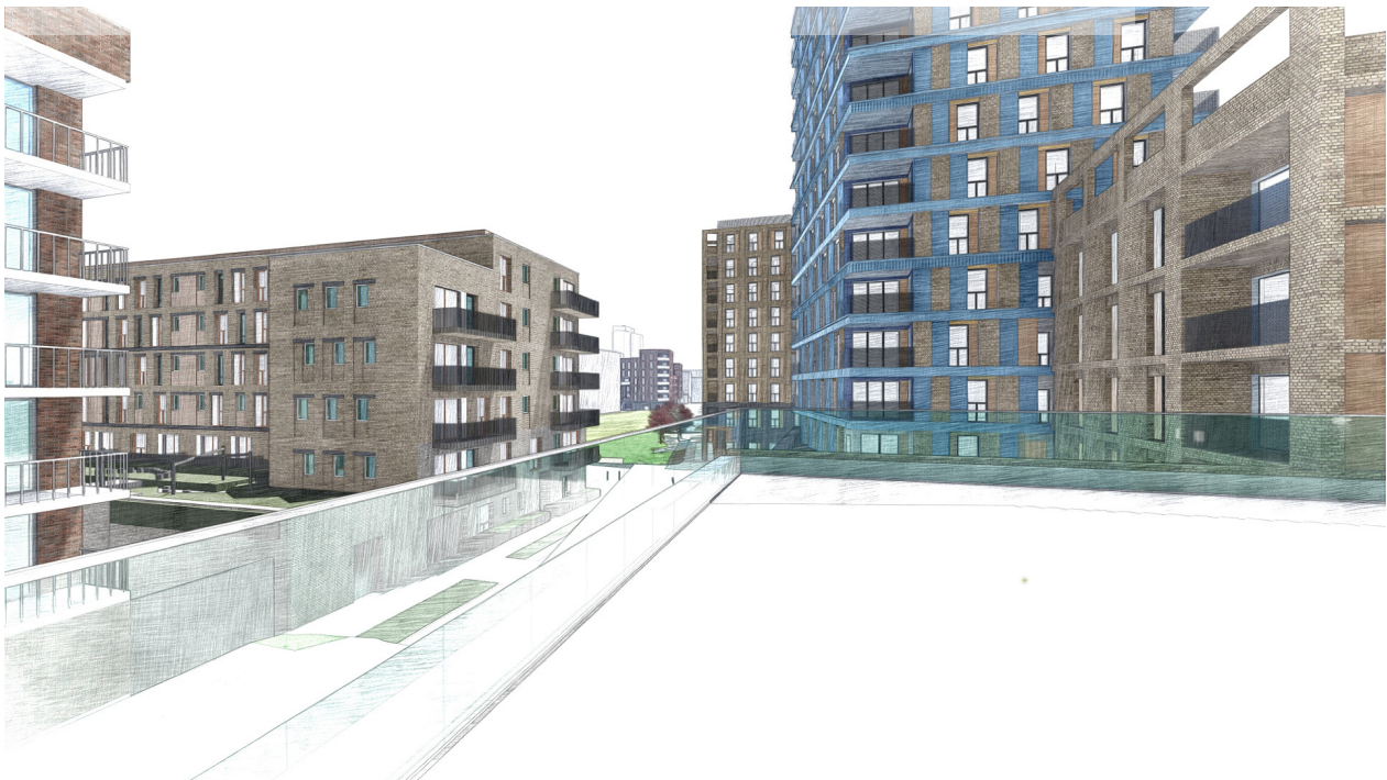
FIGURE 11. PROPOSED SCHEME