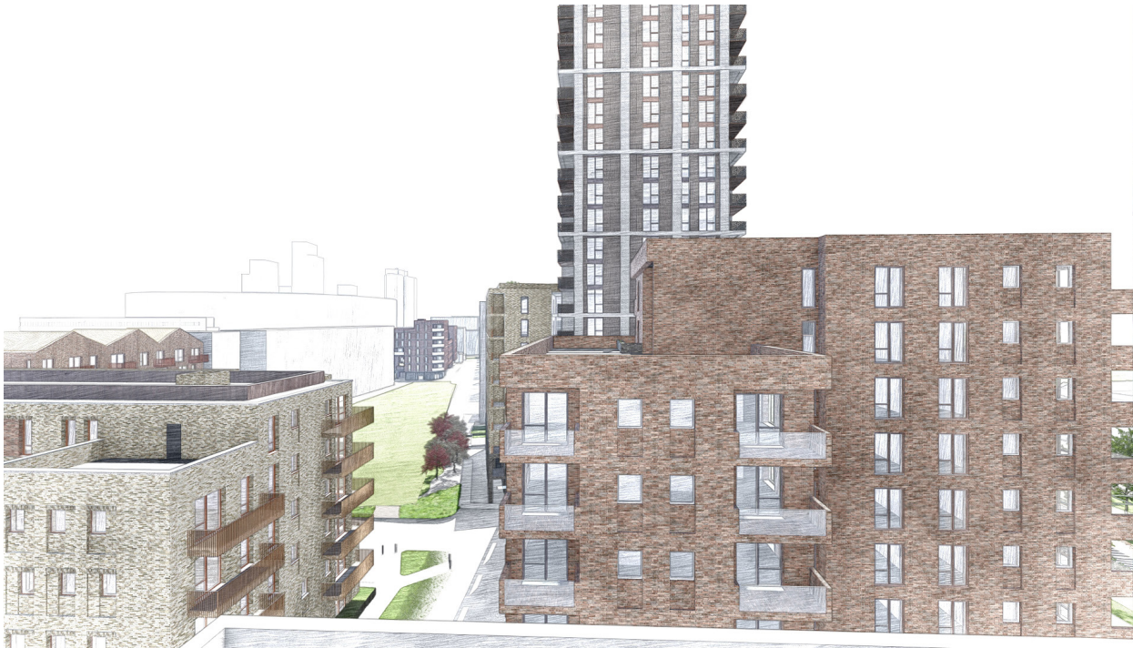
FIGURE 13. APPROVED SCHEMES