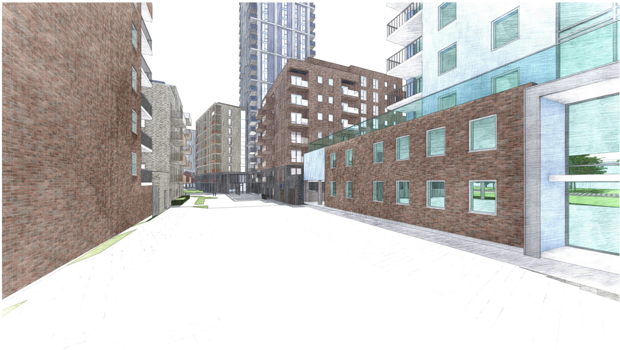
FIGURE 7. APPROVED SCHEMES