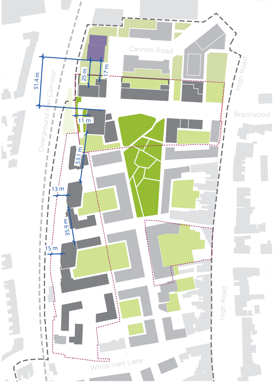
FIGURE 3. APPROVED BLOCKS PLACEMENT