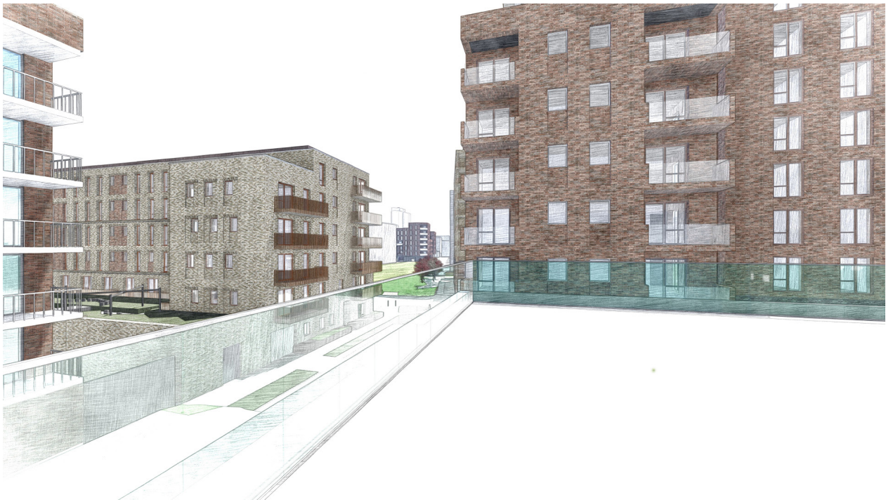
FIGURE 10. APPROVED SCHEMES