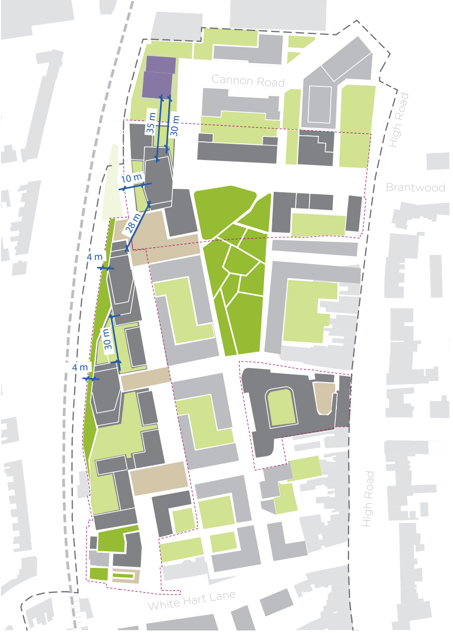
FIGURE 4. PROPOSED BLOCKS PLACEMENT