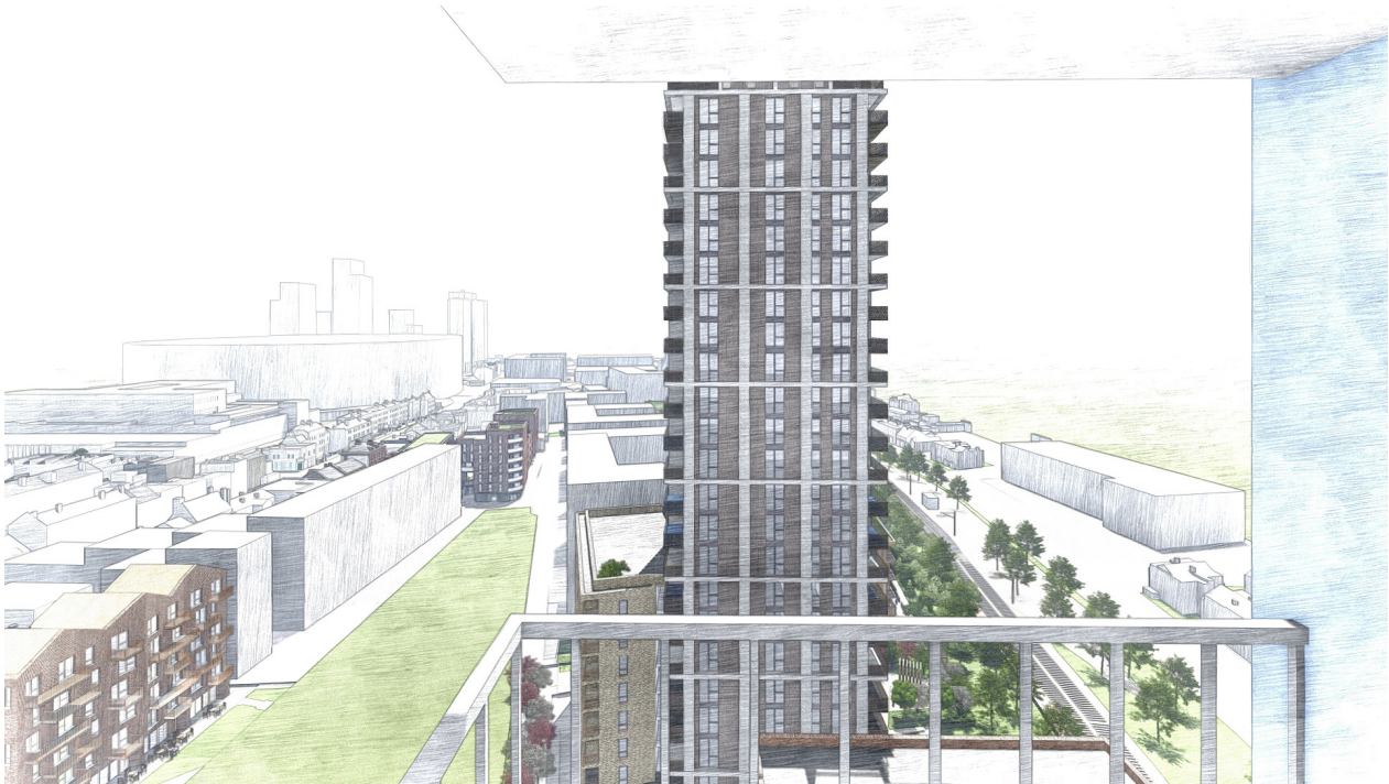
FIGURE 16. APPROVED SCHEMES