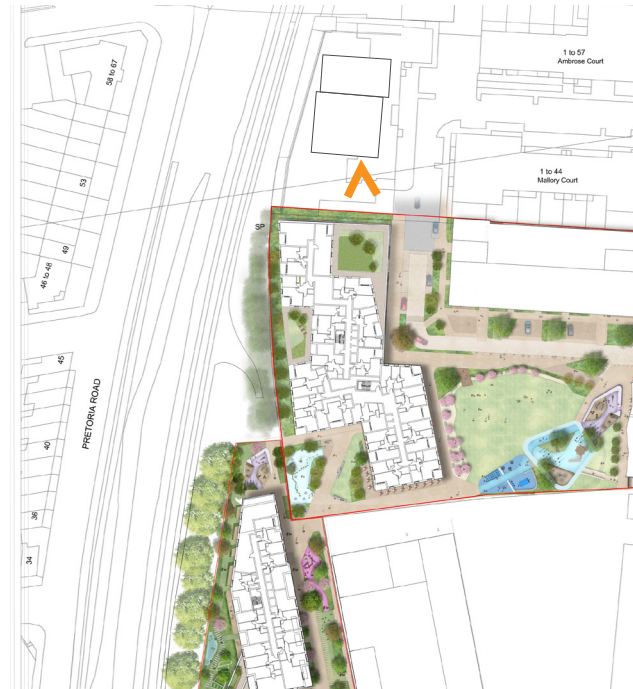
FIGURE 12. KEY PLAN