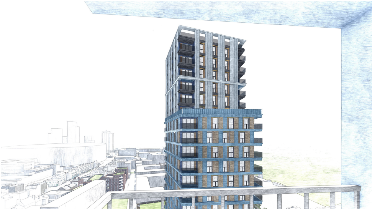
FIGURE 20. PROPOSED SCHEME