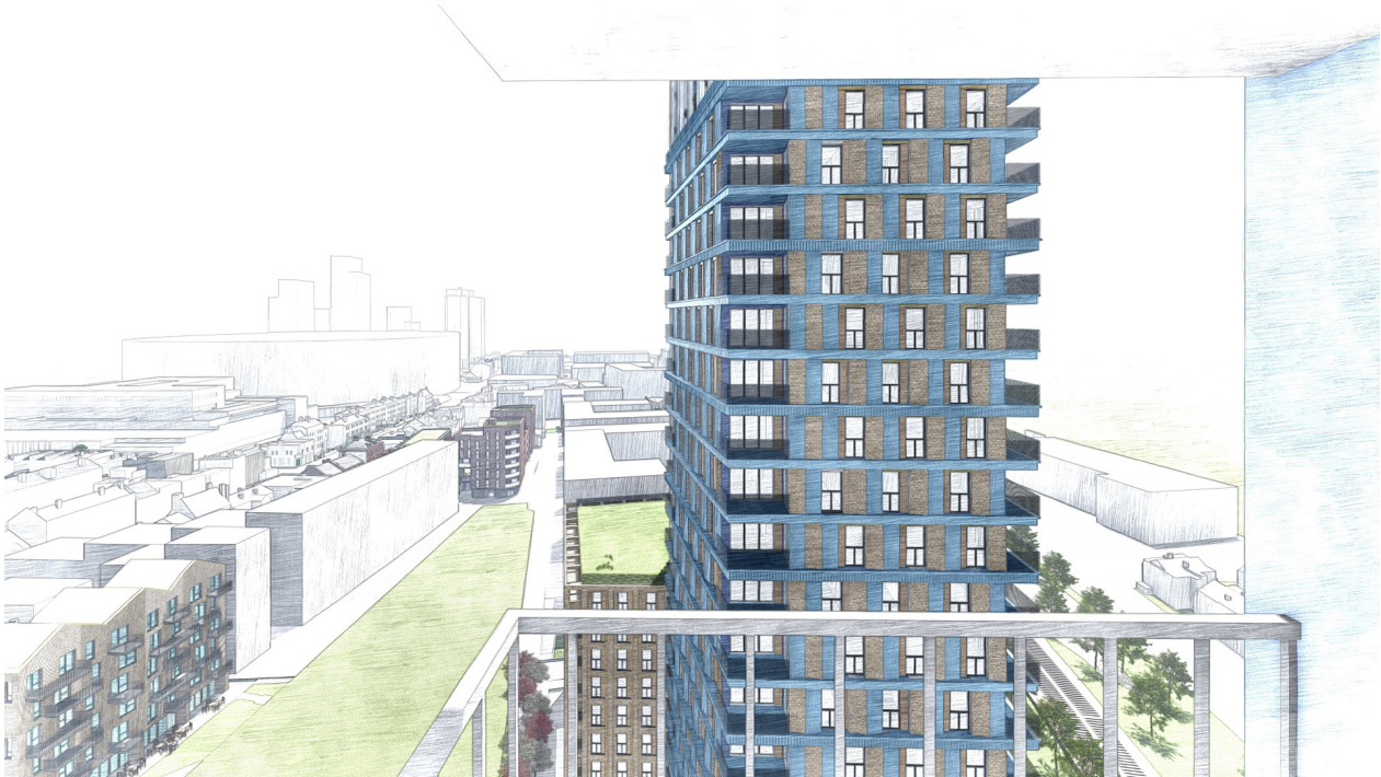
FIGURE 17. PROPOSED SCHEME