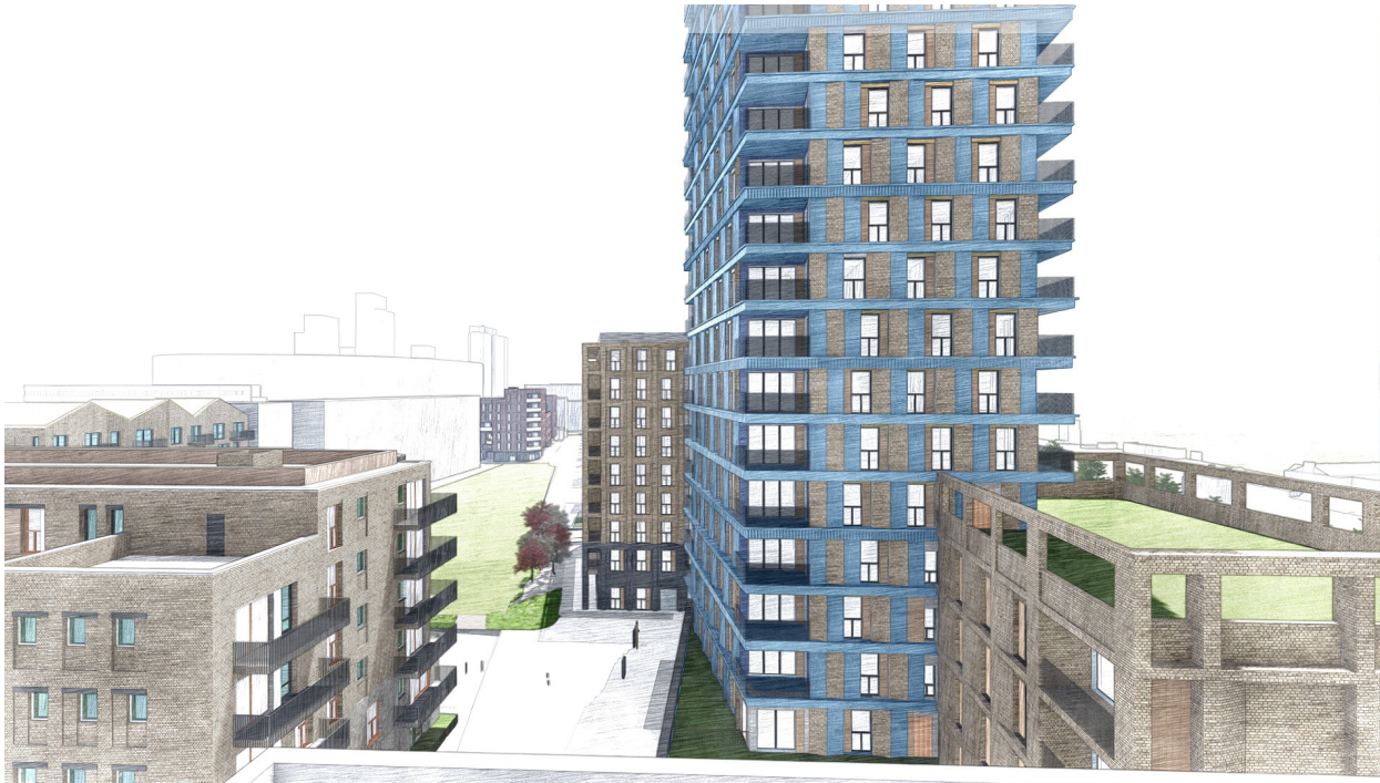
FIGURE 14. PROPOSED SCHEME