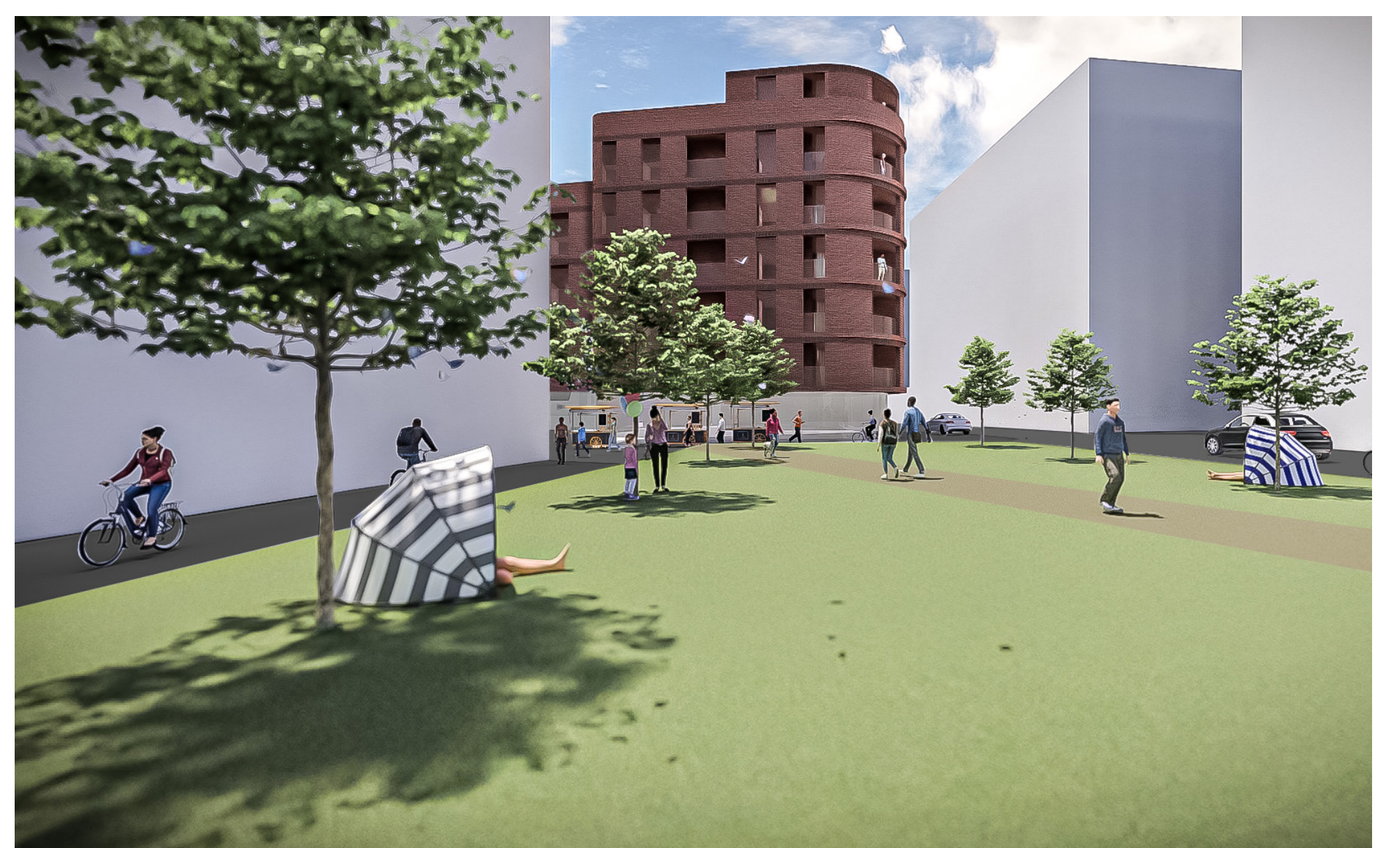
View from Peacock Park