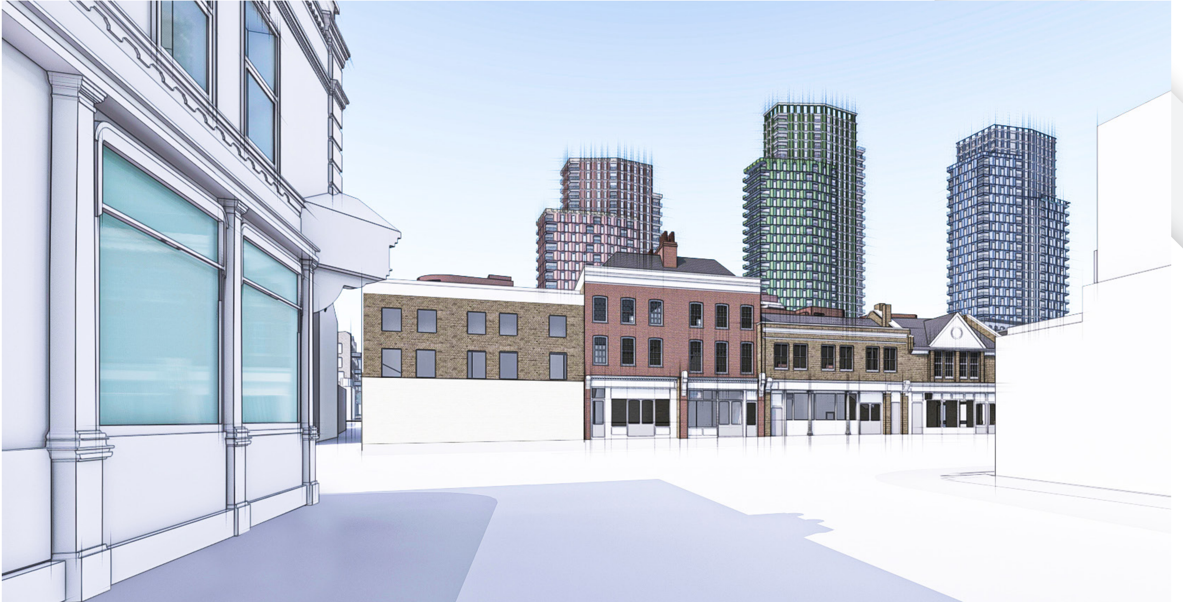
View from Northumberland Park with Goods Yard and The Depot in the background