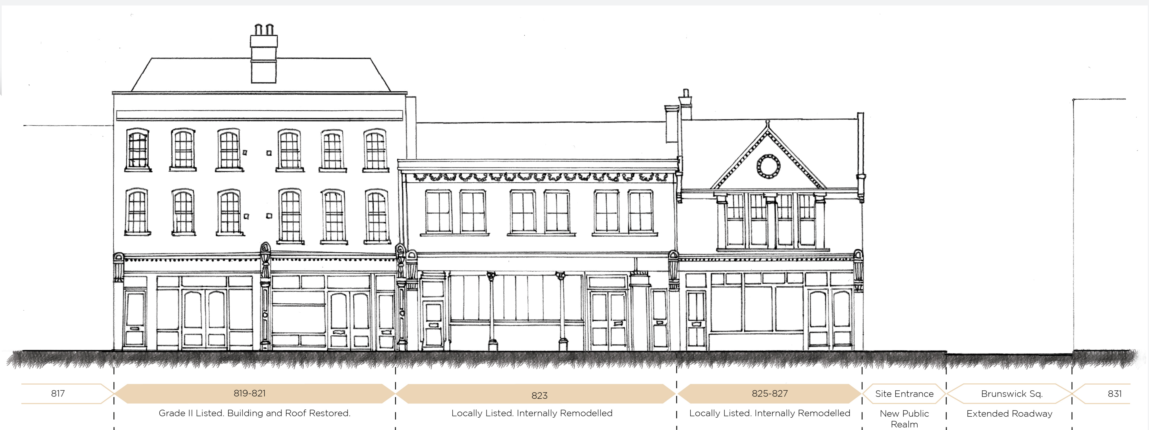
How we propose to restore them

We intend to retain and restore the Grade II Listed buildings on site (819-821 High Road), refurbish the historic buildings at numbers 823-827 whilst retaining and restoring facades on all heritage assets.