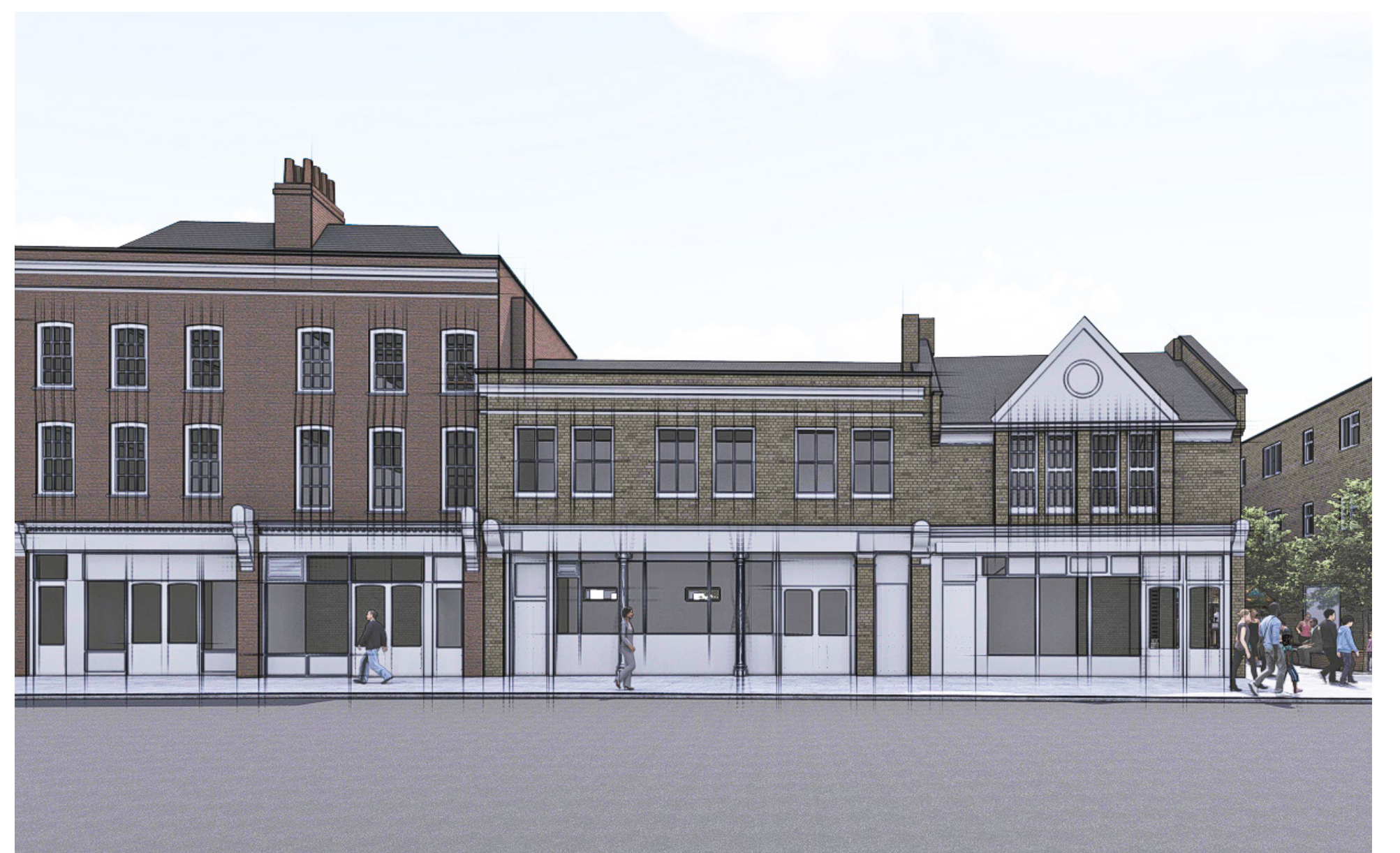
View of High Road Buildings