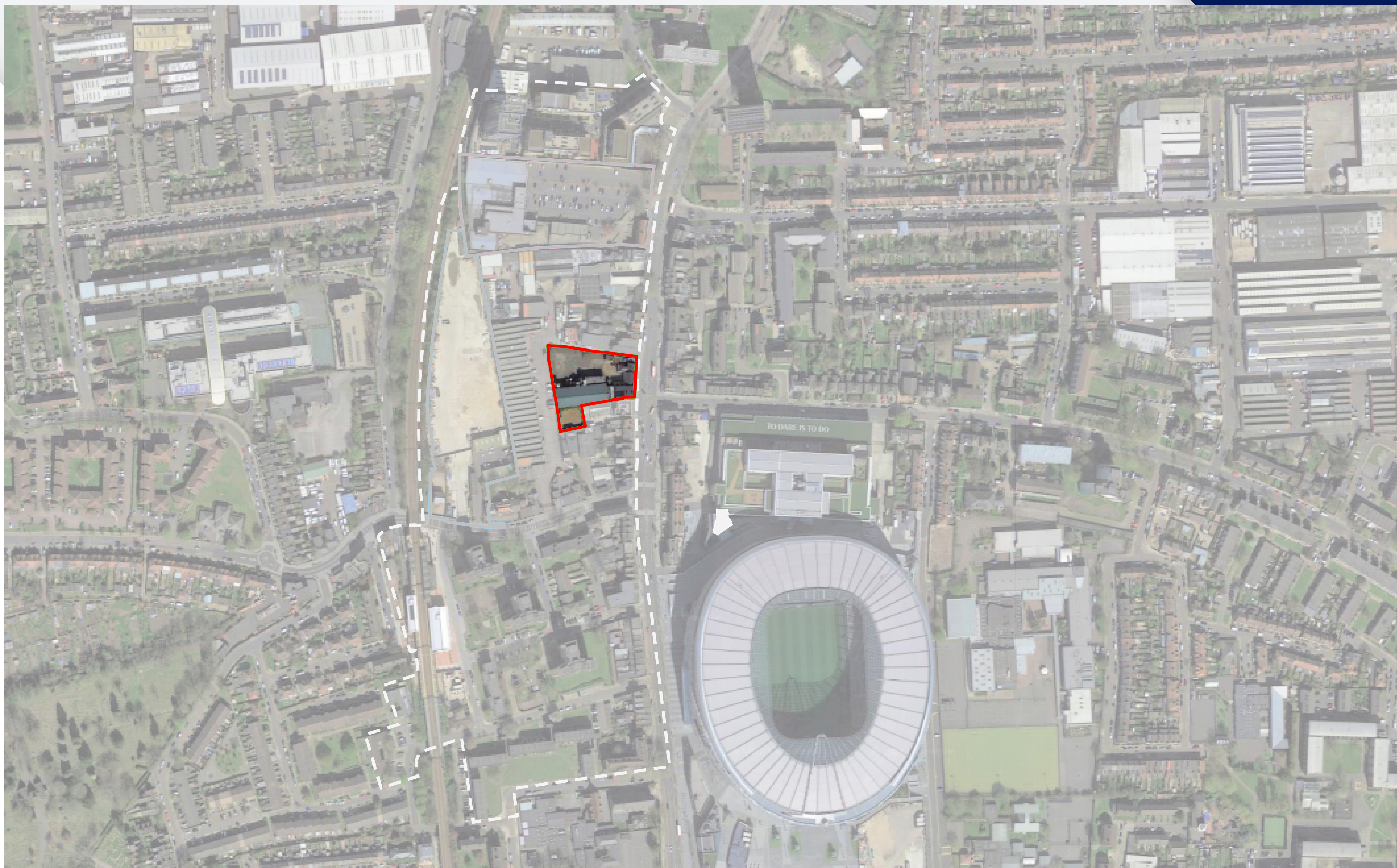
Aerial image showing the red line boundary of the site

The Printworks is located at 819-829 High Road, opposite the junction with Northumberland Park and just east of the Peacock Industrial Estate. It is east of the Goods Yard site and south of The Depot site.