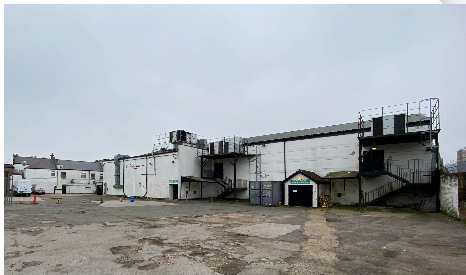
Photos of the site as it is now