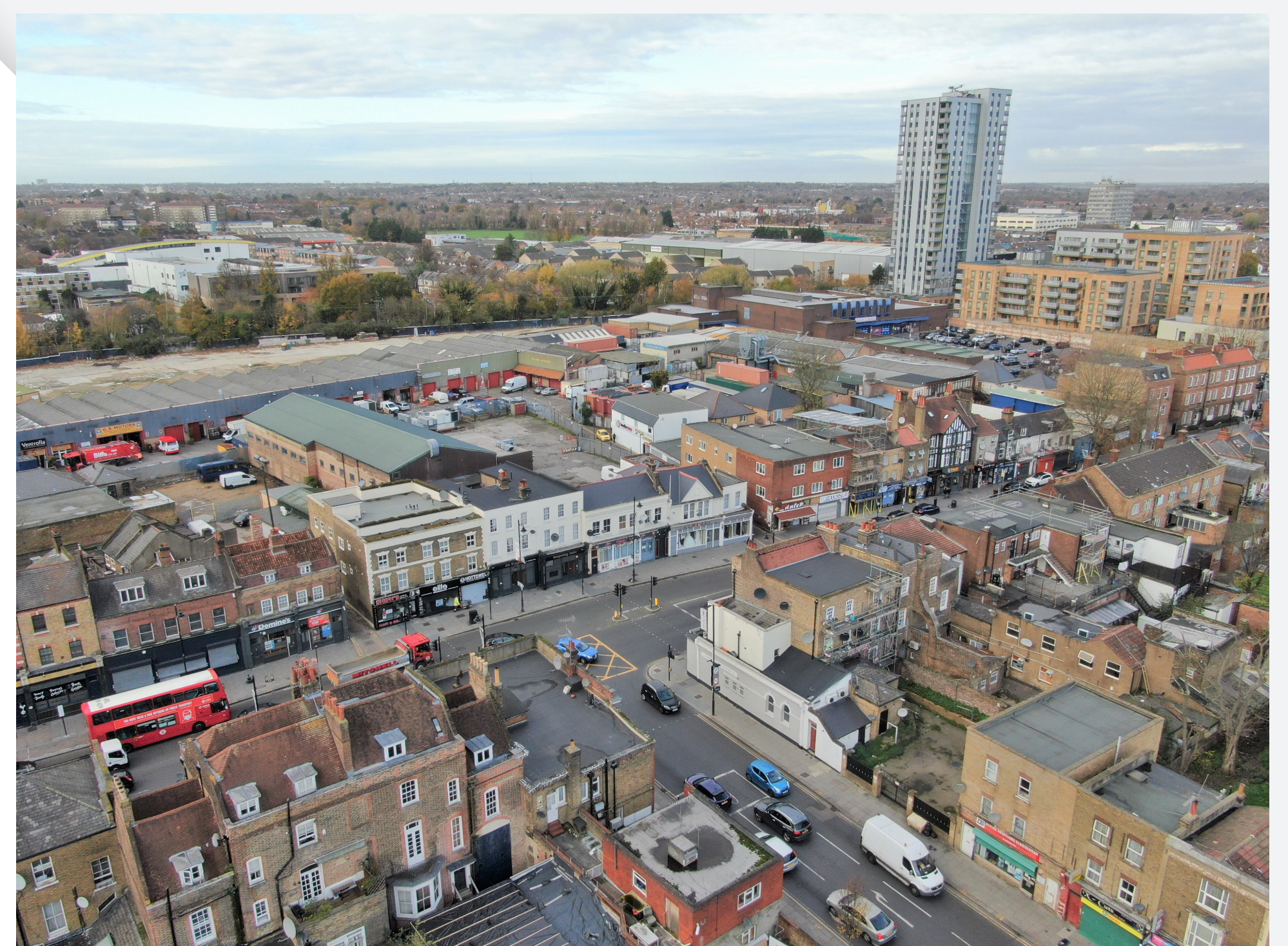
Aerial image showing the current shop frontages

The new homes, workspaces and commercial space are largely not visible when viewed from the High Road, protected from view by the retained and restored frontages.