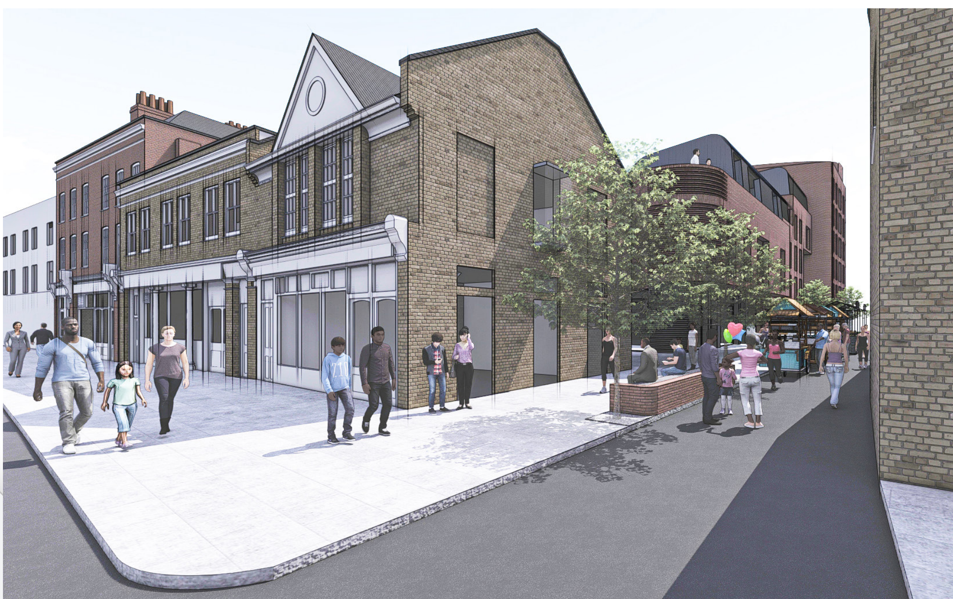
View of High Road and Brunswick Square