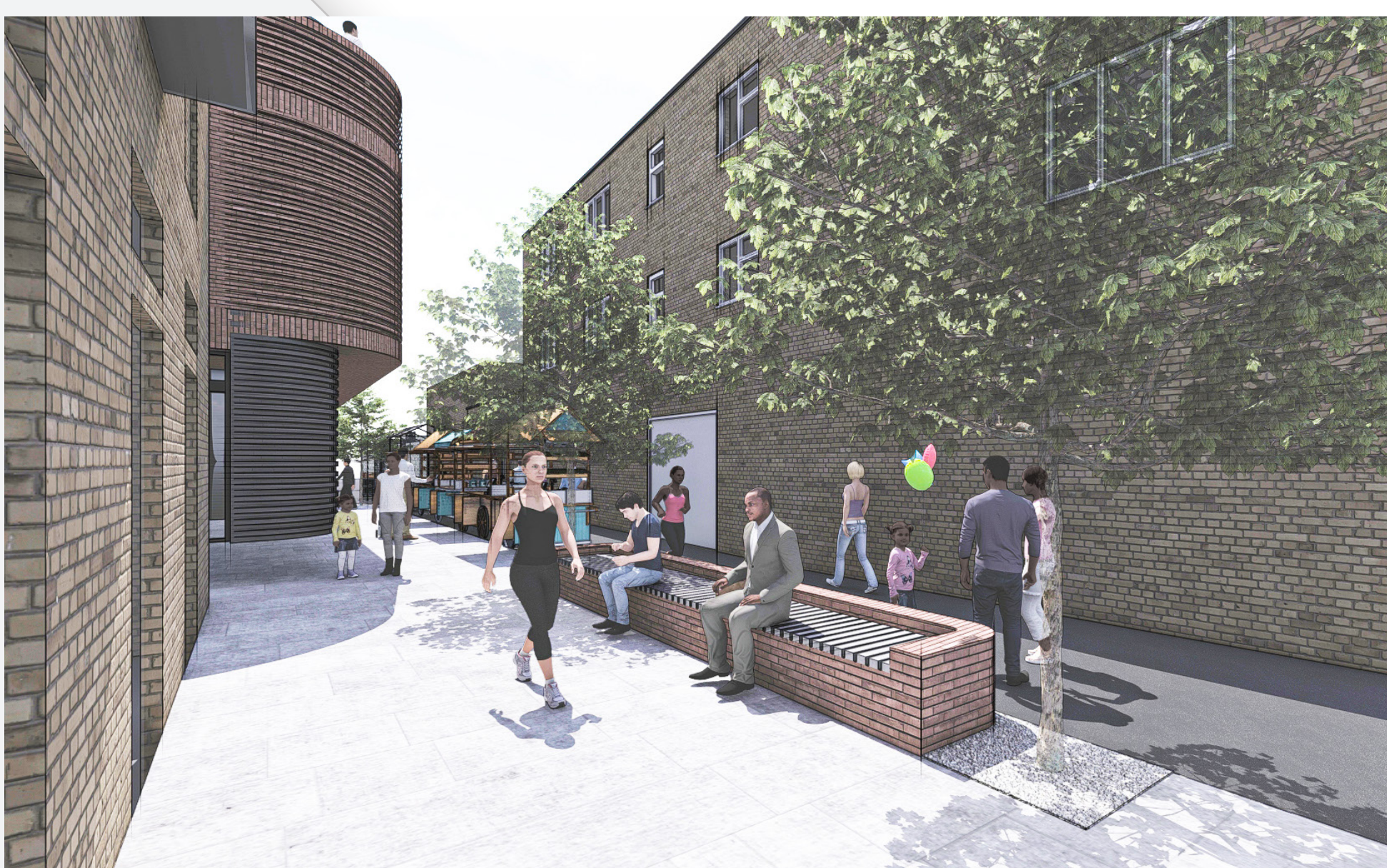
View West Along Brunswick Square